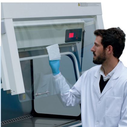
Easy cleaning of the inside window.

The Bio II Advance Plus has a colour screen which enables easy and quick viewing of the safety parameters. The visual display shows the level of filter clogging, which is extremely useful for optimising the service. The display also shows laminar speed flow to control the cabinet's status at all times.