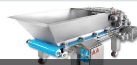
Shaffer® Dough Kibbler

Shaffer manufactures flighted incline conveyors to move dough from the kibbler to downstream equipment. Horizontal conveyors are also available and all conveyors are customized to meet your bakery's needs.