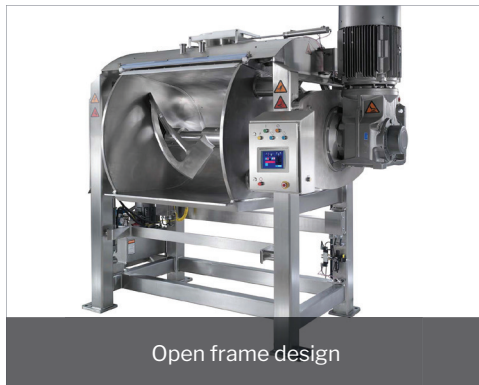
Open frame design