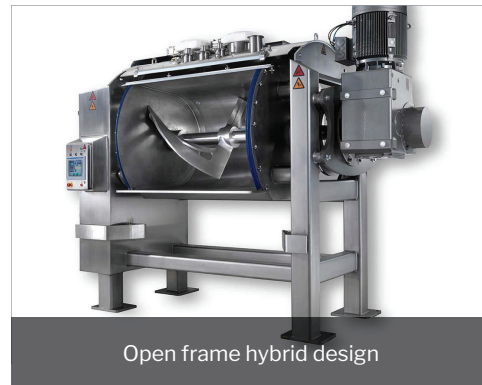
Open frame hybrid design