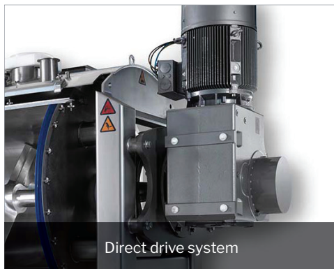
Direct drive system