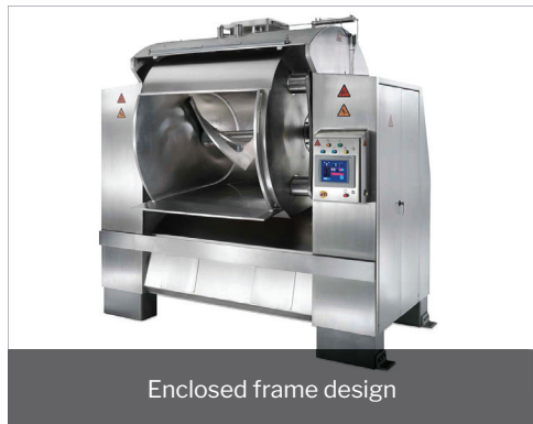
Enclosed frame design