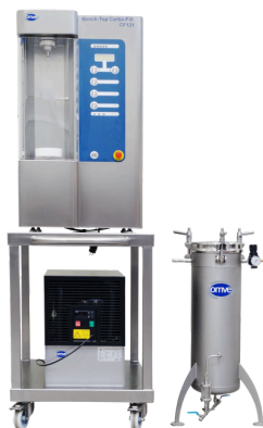
CF121 on stainless steel trolley with chiller & external 20L vessel

OMVE Netherlands B.V. Gessel 61 3454 MZ, De Meern The Netherlands Tel +31 30 241 00 70 sales@omve.com omve.com