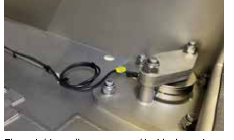
The weighing cells are mounted inside the main cabinet, protected from cleaning and water spray.