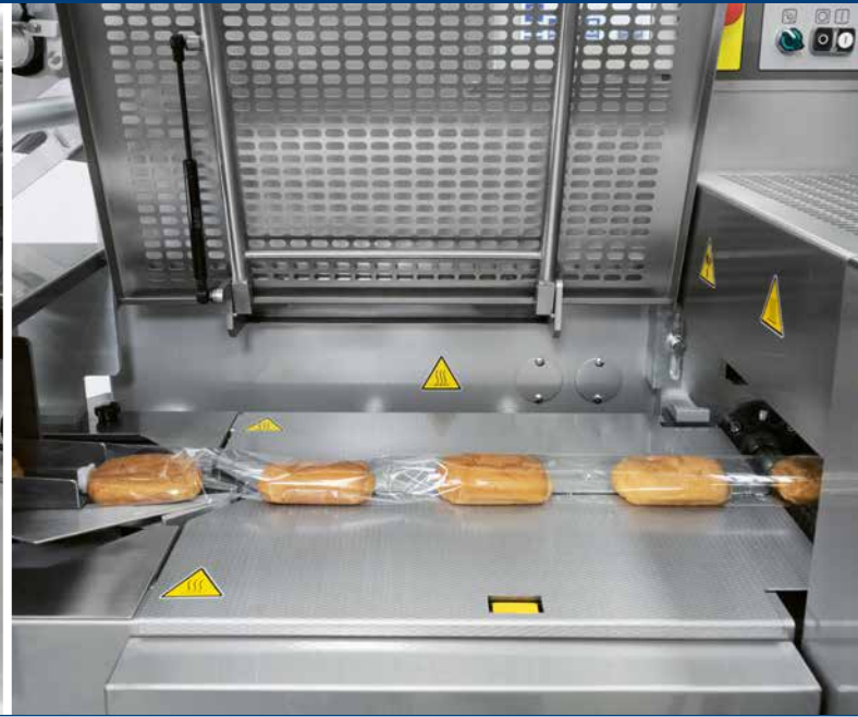
Bottom sealing unit