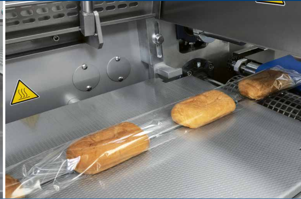
Bottom sealing unit