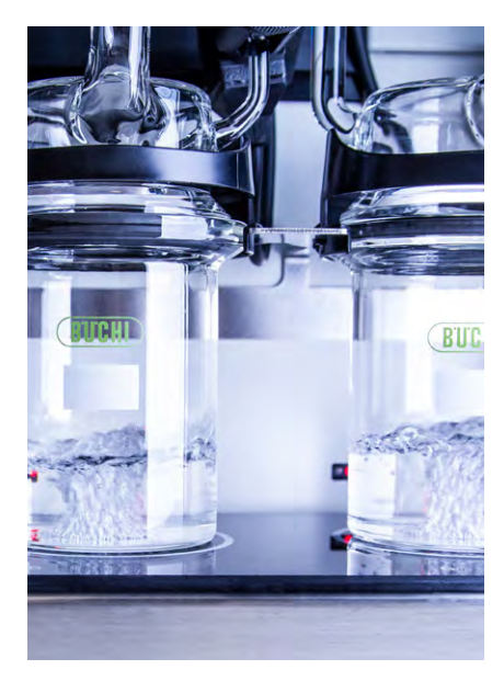
Powerful and fast extraction

BUCHI offers dedicated extraction solutions for fat determination, as well as for residue and contaminant analysis in various matrices. We cover the entire range of automated extraction methods. Our solutions allow for perfect workflow integration, thus minimizing manual steps.